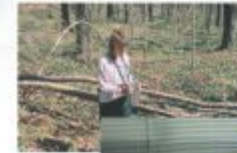
Geology often combines both field and lab-based work.

Geologists may pursue careers in research, or they are hired in the mineral and petroleum industries. Their expertise is also sought in the fields of environmental science and geo-hazards (e.g. earthquakes).