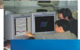
Environmental Geologists help with old mine site remediations.

Geological engineers apply earth science principles to find and extract the world's energy and mineral wealth, to help design foundations for dams, buildings, and highways, and to protect our environment from pollution and waste.