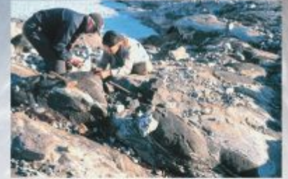
Geologists taking measurements during field work.

Students with a strong grounding in general science and a love of the outdoors will find rewarding careers in the Earth Sciences. Degrees are granted in the Arts and Science Faculty and the Applied Science (Engineering) Faculty with various career path options.